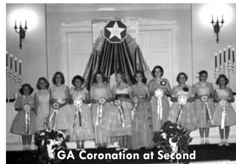
GA Coronation at Second